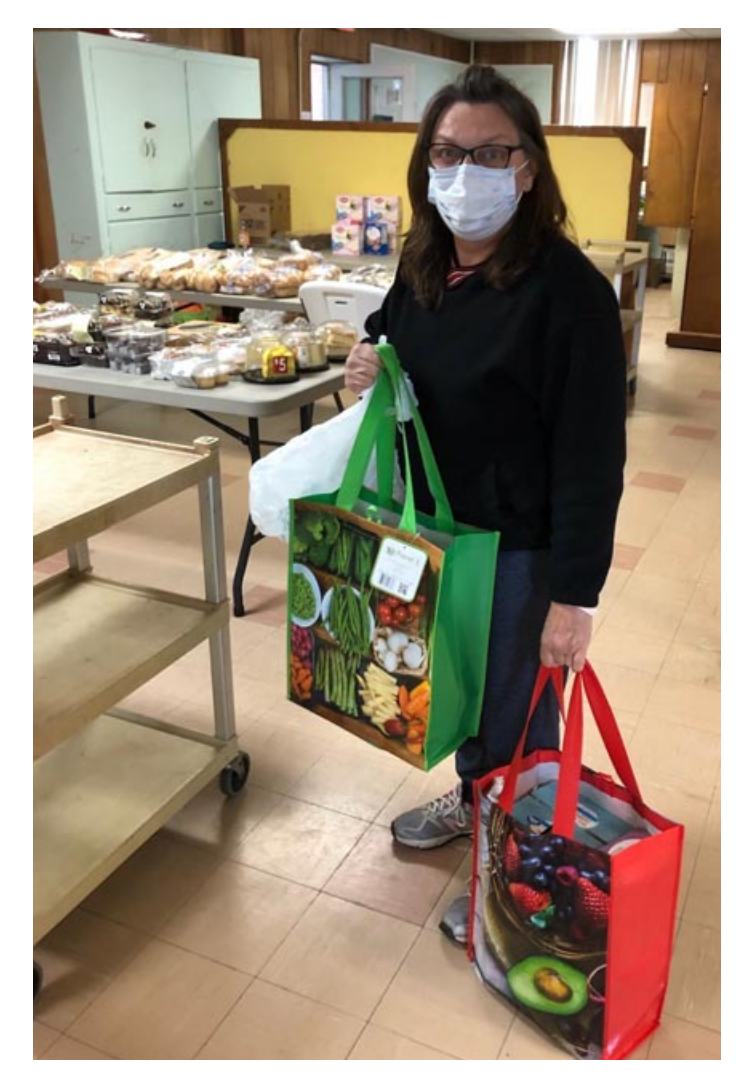
The Main Street Food Pantry is working with the Hamilton School District and other community partners to reach more families in this time of need.