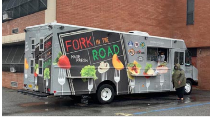
Camden City School District’s food truck is just one way the district is feeding children during the pandemic and beyond.