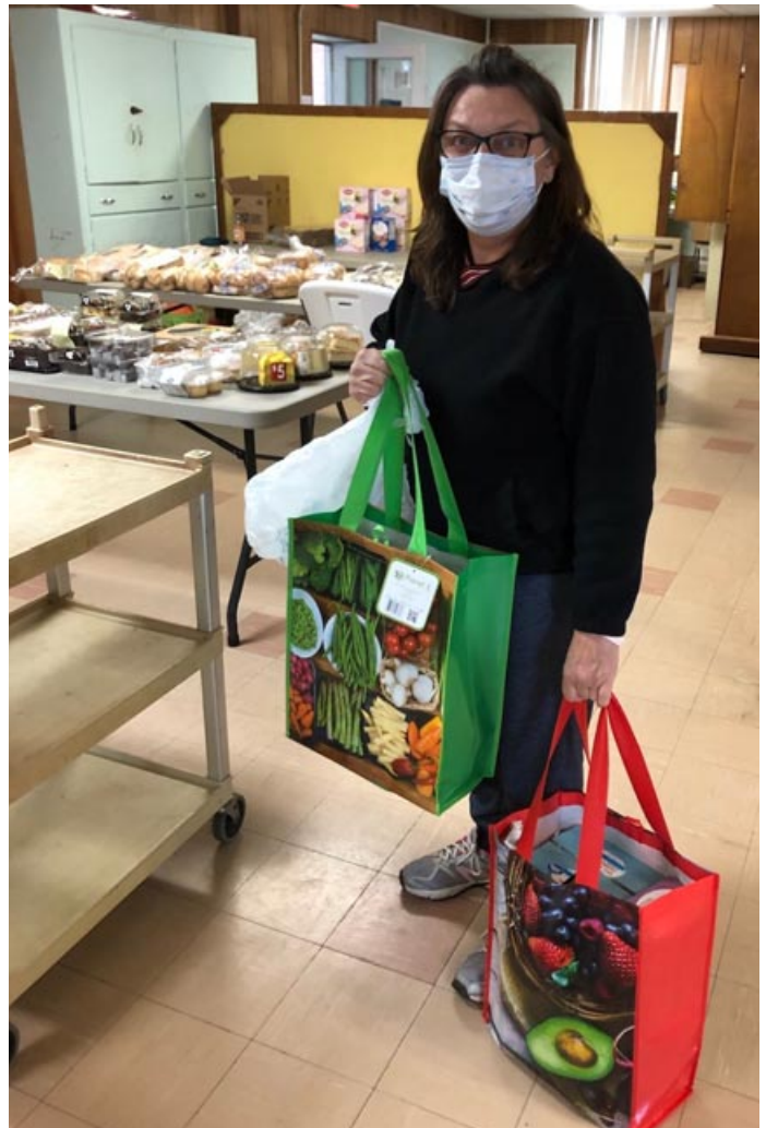
The Main Street Food Pantry is working with the Hamilton School District and other community partners to reach more families in this time of need.